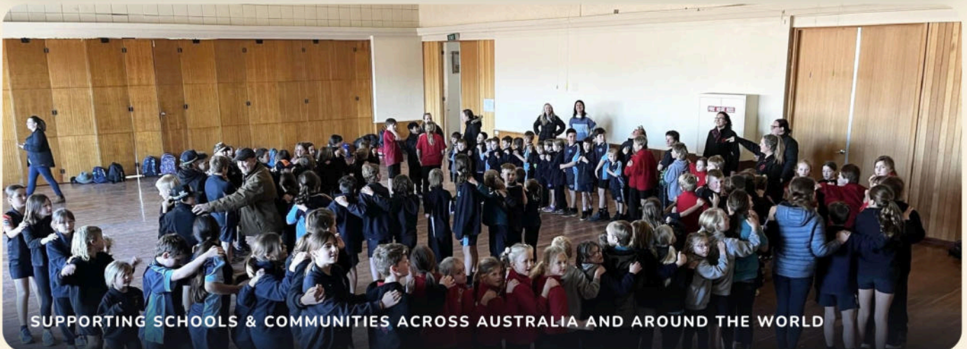
SUPPORTING SCHOOLS & COMMUNITIES ACROSS AUSTRALIA AND AROUND THE WORLD

“School of Play has changed the way our Wednesdays feel. The energy is different and that positivity carries into the rest of the week.”